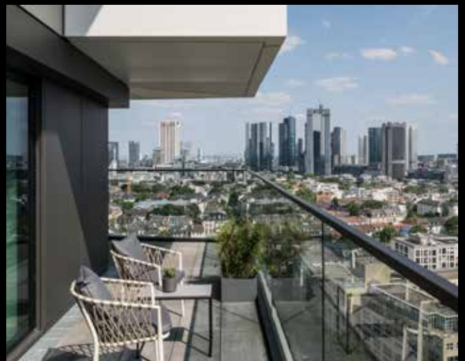
PROJEKT: ONE FORTY WEST (T-REX), Frankfurt, Germany